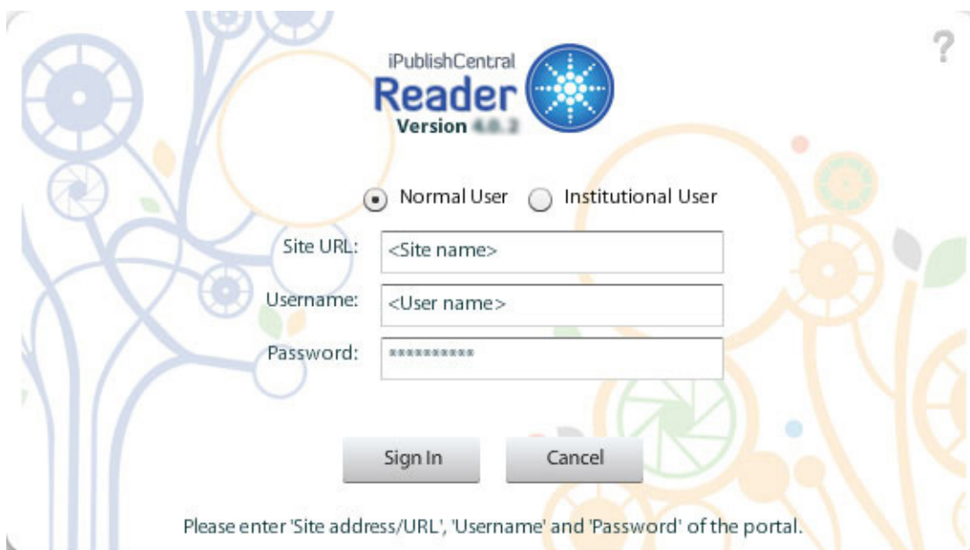
Figure: Login Screen for an Normal user