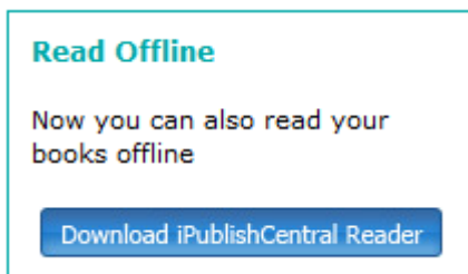
Figure: Download iPublishCentral Reader