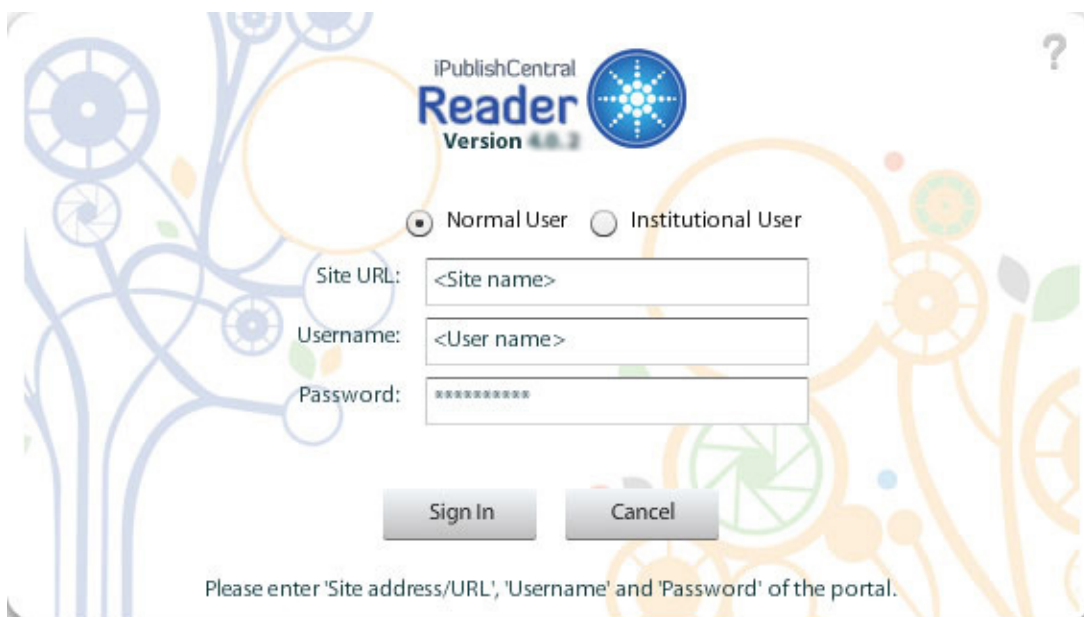
Figure: Login Screen for an Normal user

To log in into iPublishCentral Reader, you should have an online account in iPublishCentral Publisher's portal. Account type can be either an Normal user or an Institutional user.