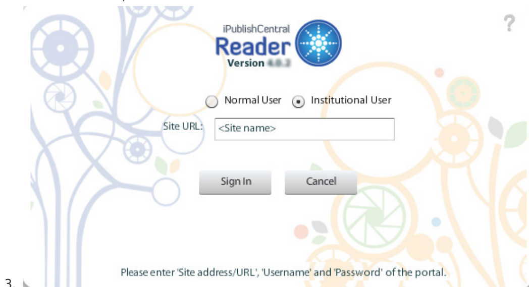
Figure: Login Screen for an Institutional user

If you do not remember the URL of the site from where you have downloaded the iPublishCentral Reader, enter a word in the Site URL field. A list of publisher’s portal containing the entered word appears in the drop-down list. Select the appropriate portal.