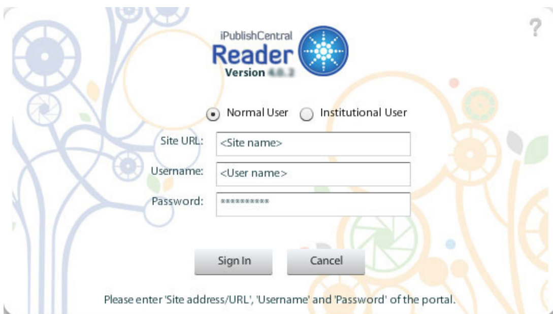
Figure: Login Screen for an Normal user

To log in into iPublishCentral Reader, you should have an online account in iPublishCentral Publisher's portal. Account type can be either an Normal user or an Institutional user.